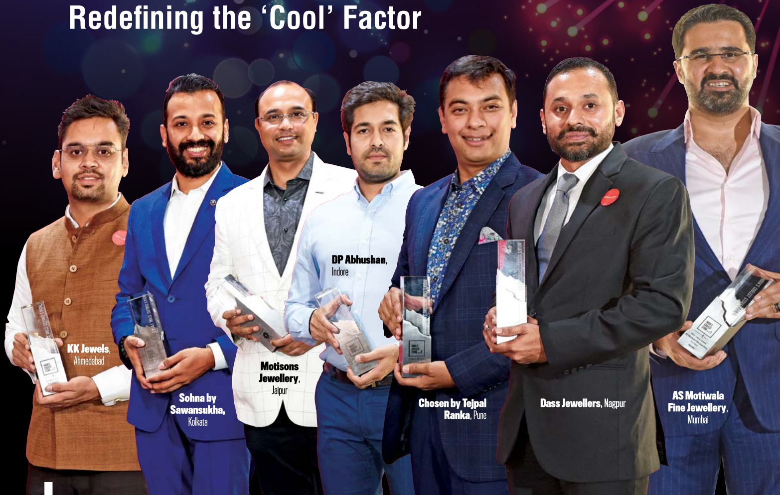
KK Jewels, Ahmedabad